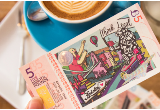
Image Source: Artist designs featured on local currency Bristol Pound https://bristolpound.org/